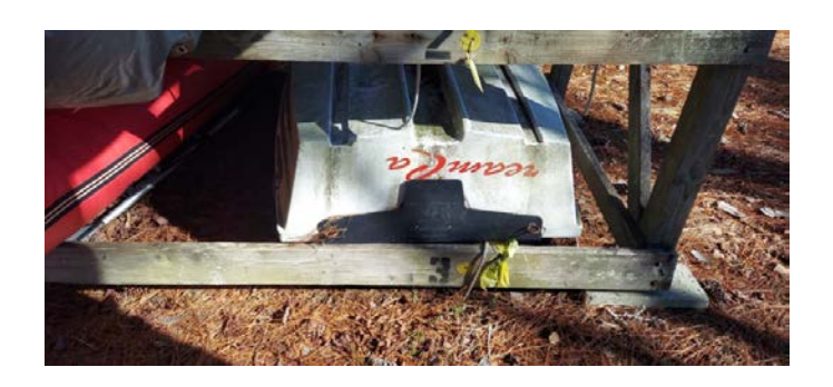
Hard Dinghy Rack 3