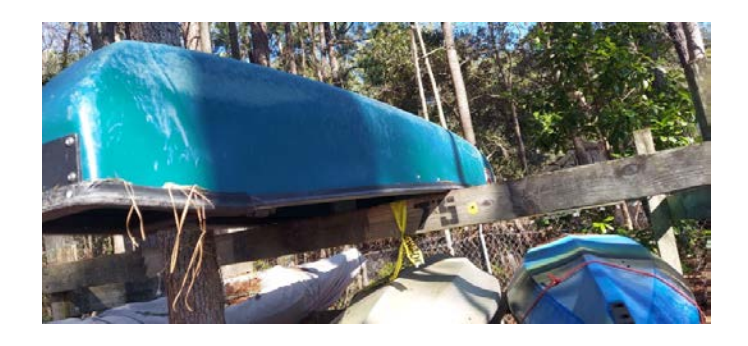
Green Canoe Rack 75